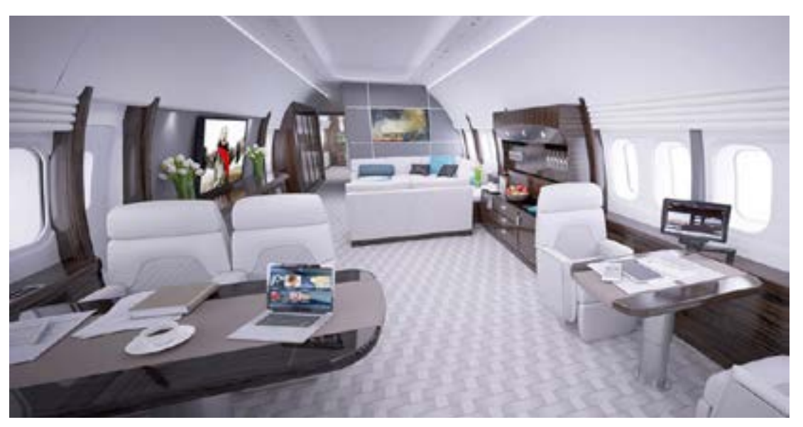
Comlux is working with Rockwell Collins to outfit aircraft with the Venue HD CMS/IFE system, Airshow moving map, and its Stage on-demand wireless content streaming solution.

Cobham's range of SB-S Aviator systems features communications services, connectivity for the flight deck, continual positional awareness for flight tracking, flight data streaming, weather, and more. The company also offers a certified application provider program, which certifies third-party commercial