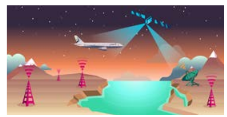
Inmarsat's European Aviation Network will bring in-flight Wi-Fi to the region's bizav sector.