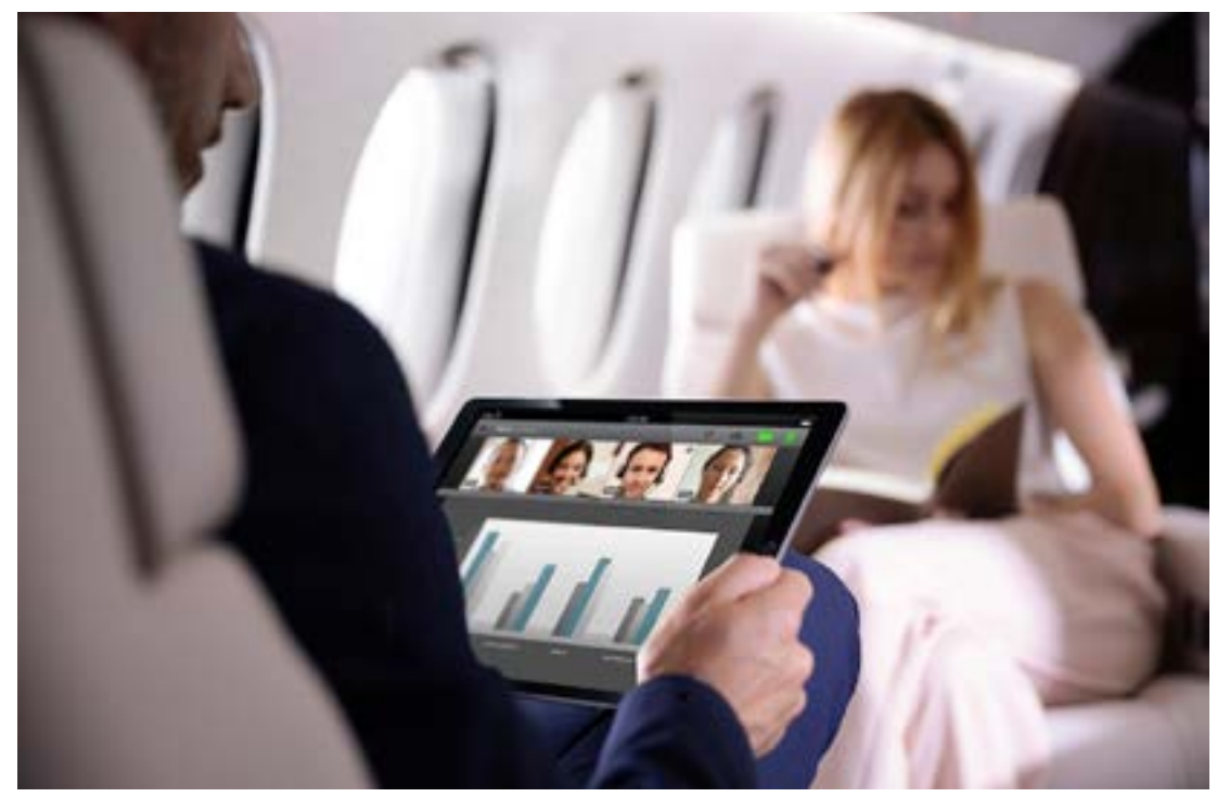
Dassault has partnered with Honeywell GoDirect services to support FalconConnect, which bundles all of the service, billing, and technical support for connectivity into one bill.