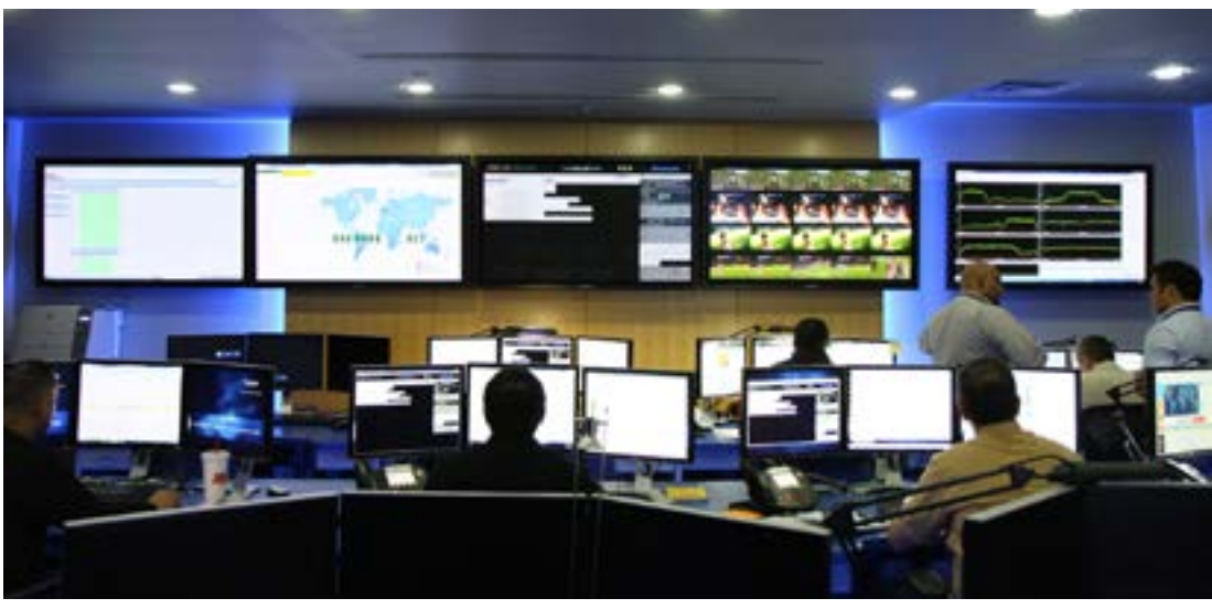
Panasonic, which operates a mission control center to monitor airlines' in-flight entertainment and communications services, entered the business aviation market in 2015.

Gogo Business Aviation reports quick uptake for its Avance L5, 4G ATG service, and expects some 500 aircraft to be flying with the system, which bowed last year, by year-end. "A software-centric approach," Avance L5 creates "a fully integrated, aviation-grade inflight connectivity and entertainment platform" that doubles